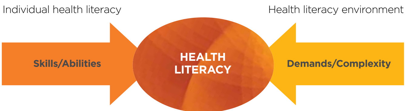
Figure 1 The two components of health literacy

Source: Parker R, Measuring health literacy: Why? So what? Now what? In: Hernandez L (ed), Measures of Health Literacy: Workshop Summary; Roundtable on Health Literacy . 2009.