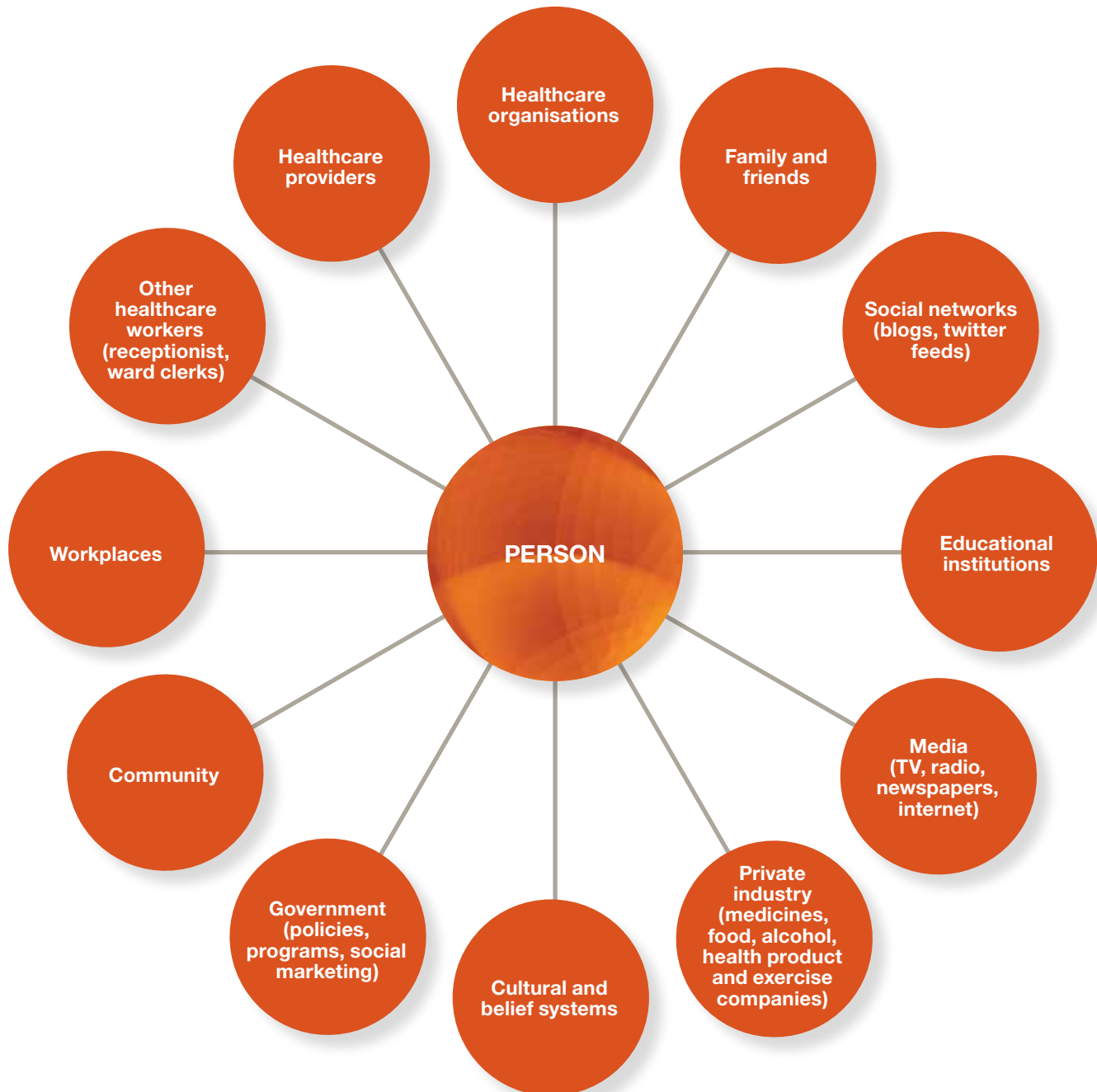
Figure 3 Examples of sources of information for consumers about health and health care

Changes in technology and expectations about consumer involvement in health care are leading to an increase in the access and use of health information from digital sources. 141,142 For example, a 2010 survey in the United States by PriceWaterhouseCoopers found that people use online tools and resources (54 per cent) second only to consulting a physician (75 per cent) when gathering information on treatments and conditions. 142 Box 14 provides an example of health information available on social media.